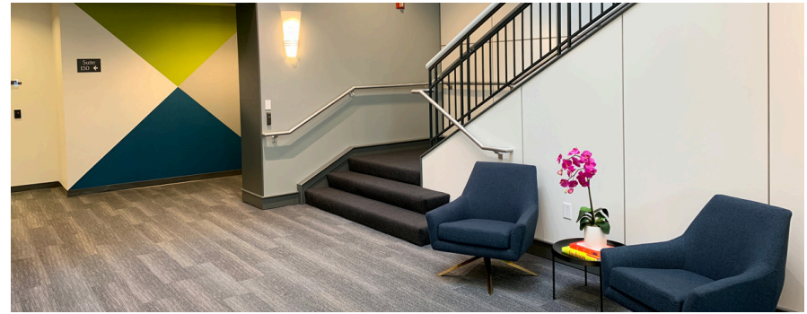
Triangle Corporate Park #1 & #2 Tigard 0 50 100 200